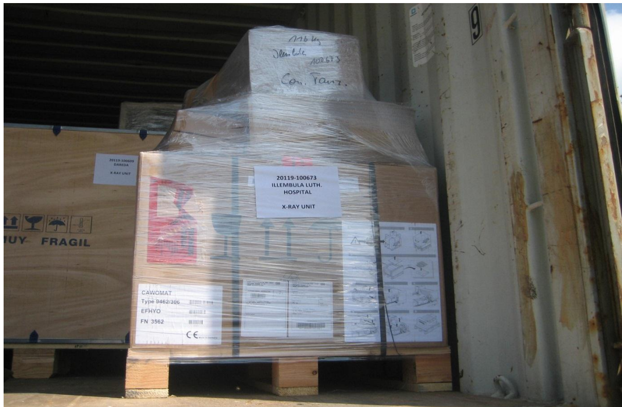
Automatic film Processing machine for Ilembula in the container before unloading at Tameq Office Dare Salam.